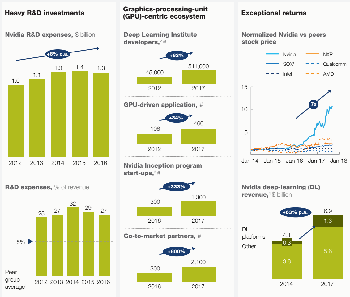
Exhibit 5 Nvidia is investing heavily in artificial intelligence, gaining market share and exceptional returns.

reached $1.3 billion (Exhibit 5). Those costs represent about 27 percent of Nvidia's total revenue—much higher than the peer group average of 15 percent—and they show that Nvidia is willing to take a different path than many semiconductor companies, which