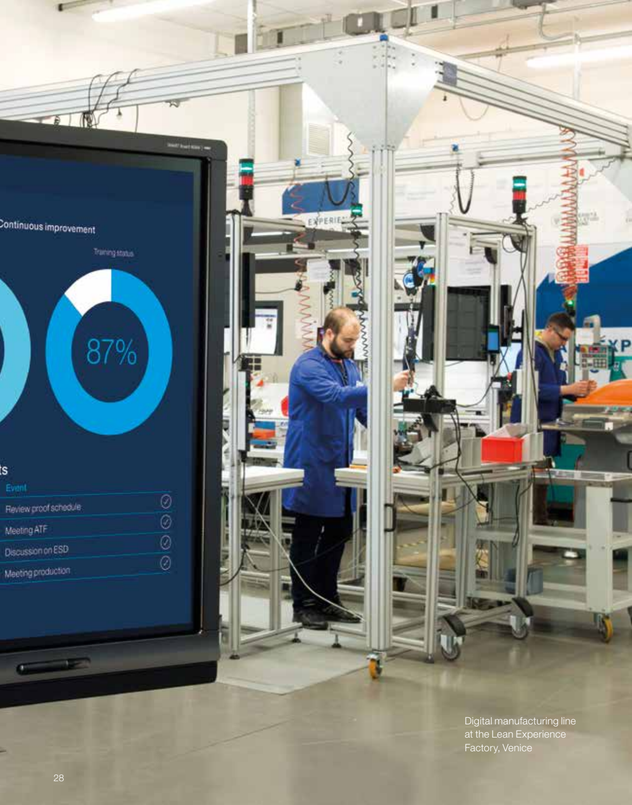
Digital manufacturing line at the Lean Experience Factory, Venice